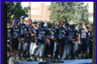
Clark Picnic 2007