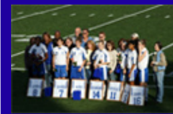
Senior Day, Homecoming 2007