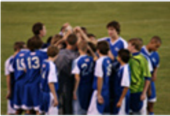
Cougar Men's Soccer